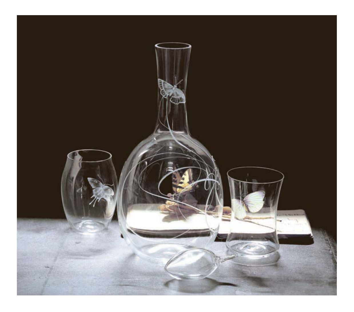
Drinking set no.279 - "Balloon"